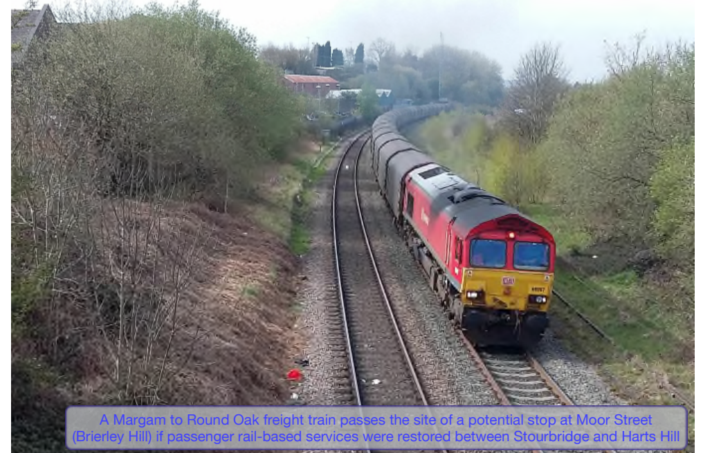
A Margam to Round Oak freight train passes the site of a potential stop at Moor Street (Brierley Hill) if passenger rail-based services were restored between Stourbridge and Harts Hill