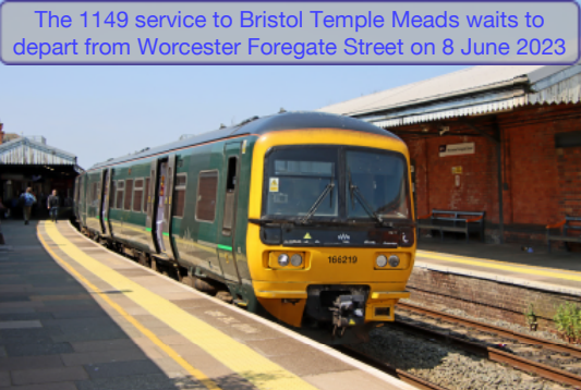
The 1149 service to Bristol Temple Meads waits to depart from Worcester Foregate Street on 8 June 2023

As an example, let's look at services in both directions departing after 0900 hrs. A train leaves Stourbridge Junction at 0901 and Kidderminster at 0909 to both Shrub Hill and Foregate Street. Connection can be made at either station onto a GWR service leaving Foregate Street at 0952 and arriving at Bristol Temple Meads at 1127. Unfortunately, the Worcester to Bristol service is slow with intermediate stops at Ashchurch