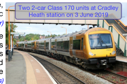
Two 2-car Class 170 units at Cradley Heath station on 3 June 2019

Class 170 Farewell. The May timetable change saw West Midlands Railway transfer its remaining Class 170 units to East Midlands Railway. The Class 170s could often be found on Stourbridge line services alongside the regular Class 172s.