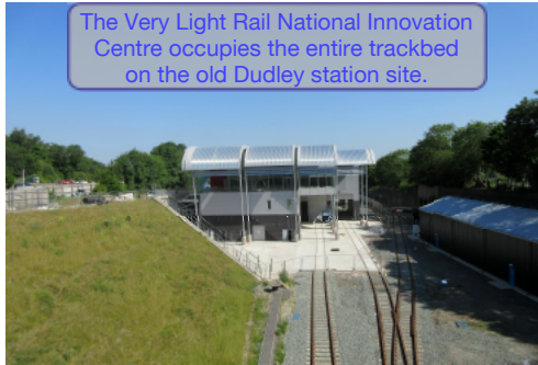
The Very Light Rail National Innovation Centre occupies the entire trackbed on the old Dudley station site.

Since its inception, one of SLUG's flagship campaigns has been the reinstatement of passenger services between Stourbridge Junction and Dudley. SLUG initially campaigned for heavy rail passenger services to be introduced between Stourbridge Junction and Walsall. However, a number of external factors has forced this objective to change. Firstly, Network Rail announced that freight services over the line, onto which passenger services could be piggybacked, would not return until the 2040s at the very earliest. Added to that, West Midlands Metro tracks will take over the line from Wednesbury to Tipton Road (Dudley) and, hopefully, from Cinder Bank to Harts Hill. Finally, the middle section, which takes in the Dudley station site, Dudley Tunnel and Blowers Green, has been taken over by the Very Light Rail National Innovation Centre and its test track, leaving no space for even a single heavy rail freight line until the centre is no longer required and is demolished.