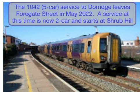
The 1042 (5-car) service to Dorridge leaves Foregate Street in May 2022. A service at this time is now 2-car and starts at Shrub Hill

SLUG has uncovered the reason for these anomalies that WMR seems loathe to publicise. The arrival at Shrub Hill at 1028 is a 4-car unit from Dorridge. This unit is then split into two with one 2-car unit shunted into the siding behind Shrub Hill. The remaining 2-car unit then operates to Stratford-upon-Avon at 1047 and does a round trip before arriving back at Shrub Hill at 1501. The other 2-car unit is then retrieved from the siding, attached to the train which departs at 1516 as a 4-car unit to Dorridge.