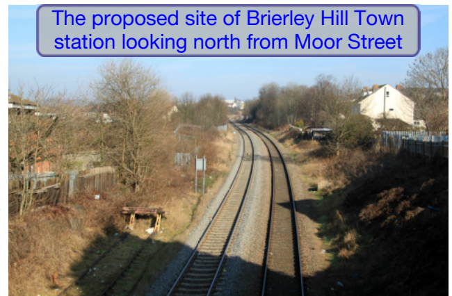
The proposed site of Brierley Hill Town station looking north from Moor Street

The first indication that the West Midlands Combined Authority were considering this link came in November 2016 when, at the Transport Delivery Committee meeting, Councillor Timothy Huxtable reported of the need to be ambitious and suggested that a Metro link (from Canal Street) to Stourbridge Junction could form part of the scheme. This was taken forward to the WMCA Board Meeting the following month when the HS2 Connectivity Package, which consisted of 25 projects to connect all parts of the West Midlands to HS2 at Curzon Street or Interchange stations, was revised to remove some schemes such as electrification to Shrewsbury and Aldridge as they were unrealistic in the timescale and replace them with projects that included “New Rail Stourbridge to Round Oak Line Canal St Station”. Of the 25 projects on the revised Connectivity Package, the Canal Street link was rated 8th in terms of Strategic Importance and 11th in terms of Economic Importance and was costed at £20m.