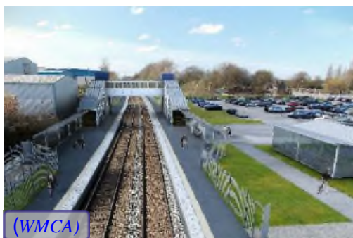
CGI designs for the proposed new stations at Darlaston (left) and King's Heath (right)

Since then, work on the proposed new services at Willenhall, Darlaston, Moseley, King's Heath and Hazelwell has reached design stage with the stations proposed for opening in December 2021. However, news on the Brierley Hill extension has gone decidedly low-key, with the project described as being "on the back burner".