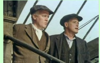
8. When The Boat Comes In