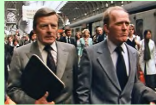
3. The Professionals