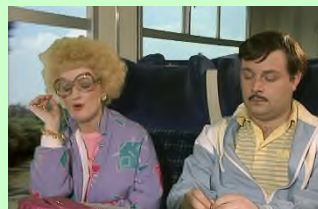
14. The Fast Show