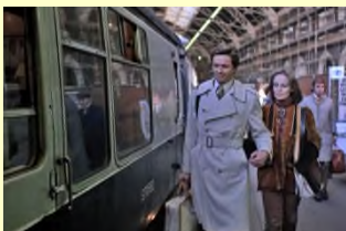
13. The Return Of The Saint