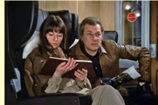
7. The Persuaders