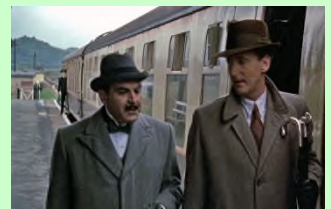
16. Agatha Christie's Poirot