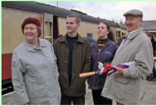
1. Hetty Wainthrop Investigates