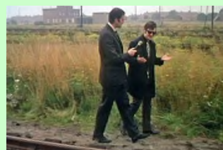
18. Monty Python's Flying Circus