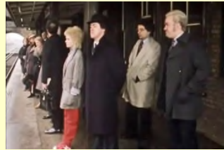
2. Not The Nine 'o' Clock News