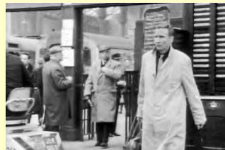
10. Public Eye