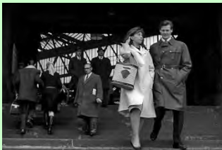
9. The Saint