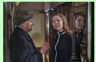
16. The Avengers