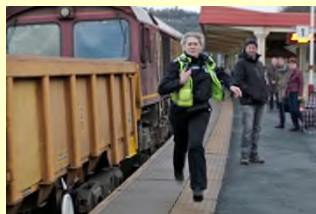
17. Happy Valley