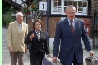
6. Doc Martin