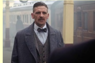
7. Peaky Blinders