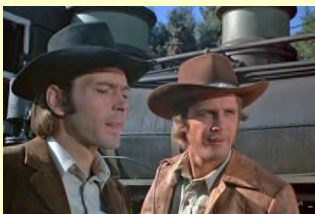
13. Alias Smith and Jones