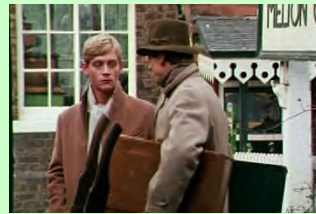
11. Brideshead Revisited