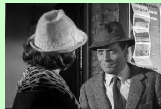
18. Danger Man