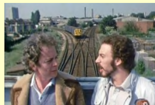
15. Big Deal