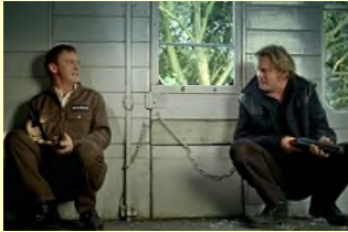
5. Life On Mars