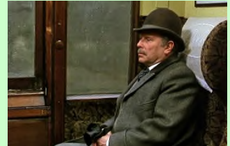
8. The Return Of Sherlock Holmes