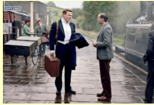
2. All Creatures Great and Small