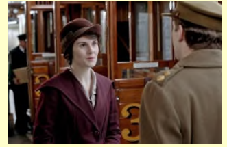
4. Downton Abbey