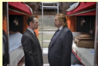
17. Inside No. 9