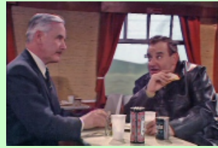
3. Going Straight