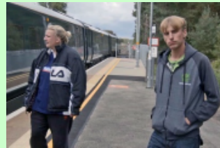
11. This Country