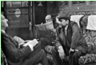
9. Hancock's Half Hour