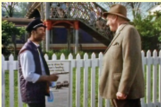
13. Waiting For God