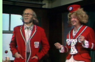
6. The Goodies