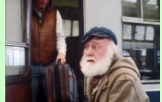
8. Only Fools And Horses