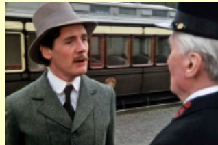
10. Ripping Yarns