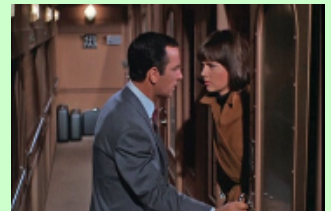
16. Get Smart