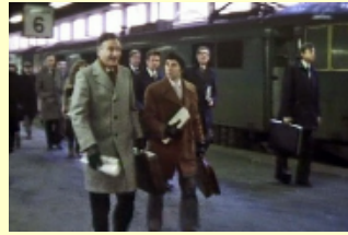
2. Yes Minister