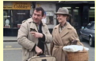
12. Three Up Two Down