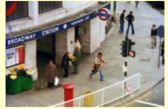
4. Citizen Smith