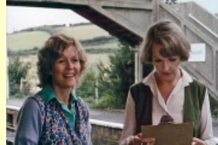
7. To The Manor Born